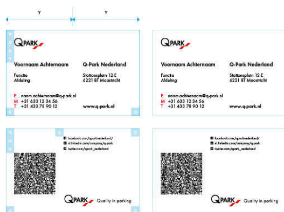
Figure 71: Business card grid

This information may also be added on the reverse of the business card as a QR code, which contains the business card details as a vCard . The QR code offers convenience as a smartphone adds the details automatically as a contact.