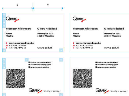
Figure 53: Business card grid

For digital printing use Symbol Freelifa satin, 300 gr/m 2