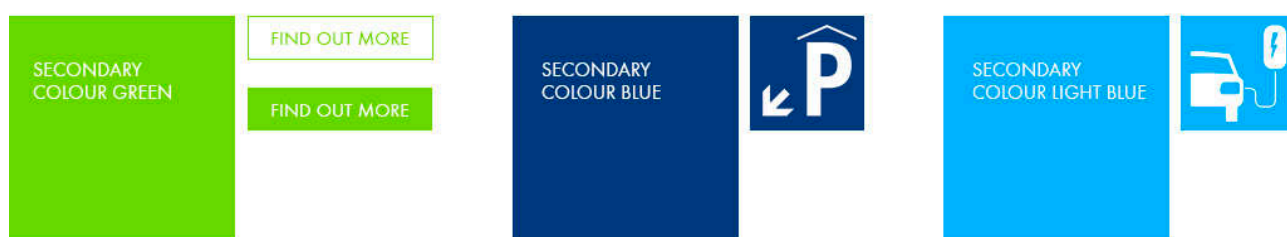
Figure 21: Secondary brand colour Q-Park green