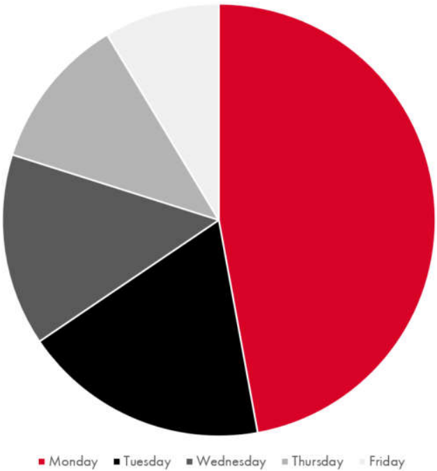
Figure 25: Pie chart example - 5 data points