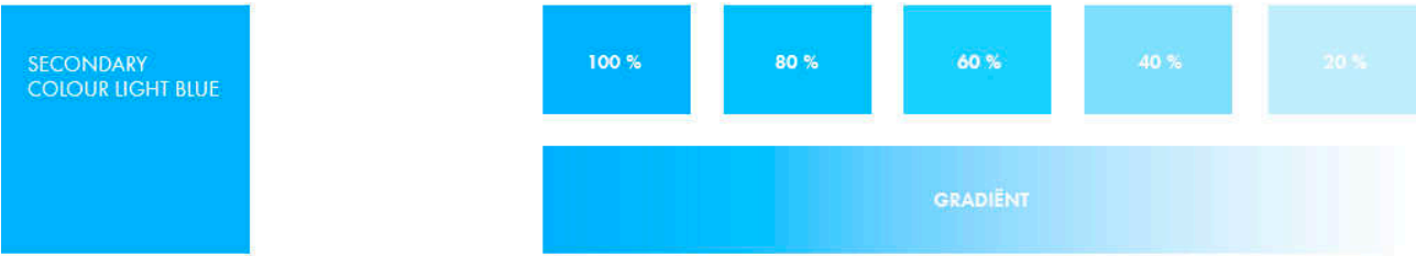
Figure 22: Secondary brand colour Q-Park blue