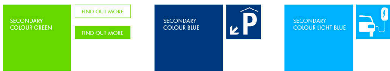
Figure 21: Secondary brand colour Q-Park green